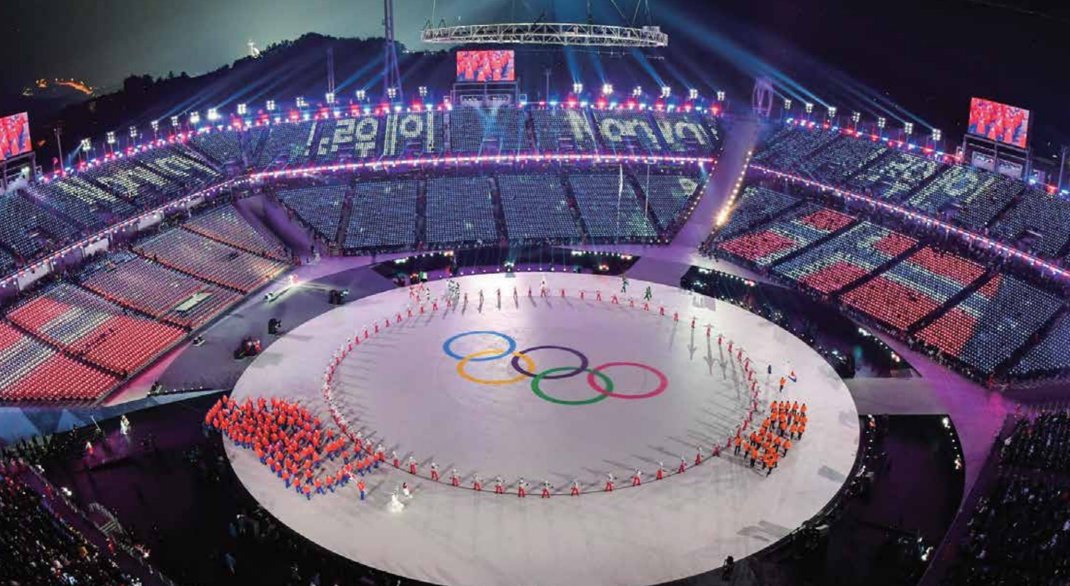
35,000 panels - 2018 Winter Olympic Games - PYEONG CHANG - Korea